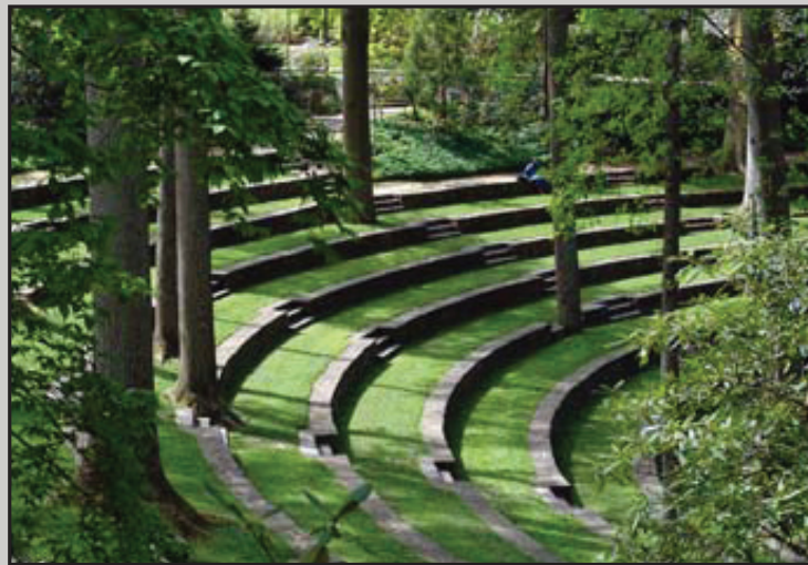
Scott Outdoor Amphitheater at Swarthmore College

The newly renovated structure will be very much in keeping with the existing Chapel and visually, there will be very little change. Flagstone steps will be used once again and the overall size will only increase slightly to accommodate the size of our current camp community. The space between each stone bench will be wider, where grass and a few trees will be planted to help with shading the area. The biggest complaint amongst the campers is the sun, so planting trees will help provide the needed shade. The grade of the existing chapel is high enough that there will be little fill needed to achieve the new gentle slope. The new Chapel area will