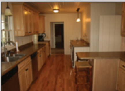
The newly renovated kitchen in High Heaven

We started the renovation with a fully updated kitchen. The space was reconfigured with all new cabinets, appliances, fixtures, and flooring. We added a larger refrigerator, a second dishwasher, and an additional oven. Now the space is perfect for a family gathering and a holiday feast!