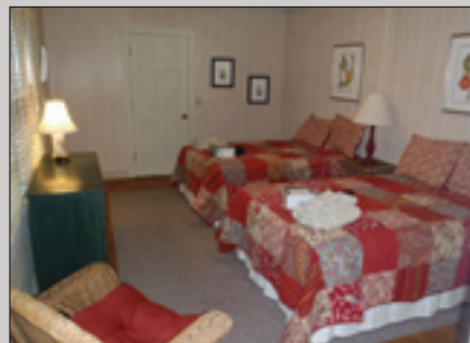
A guest room in High Heaven

We are pleased with the results of the renovation, and we can't wait for our first visitors to arrive. If you are interested in renting High Heaven, please call Phyllis in the Main Office (828-743-3300).