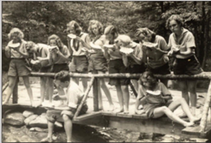
A group of campers enjoying watermelon at a hot summer day.

Inn, once located on our piece of property known as the "Inn Site", was a fashionable spot for many visiting families, their daughters enjoyed attending camp down at the other end of the lake. The bobbed haircut was all the rage, jazz music was the cat's meow, and the biggest film star of the day was Charlie Chaplin. Parents were eager for their daughters to learn the values of simple living, and in Merrie-Woode the girls found a place to thrive and call their own.