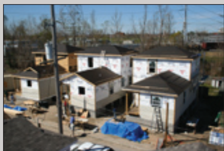
Houses on Ferry Place, New Orleans, LA